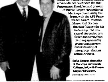
The Arizona Public Service Co. Center for Culture & Understanding at Valle del Sol celebrated the 2009 Peacemaker Breakfast...