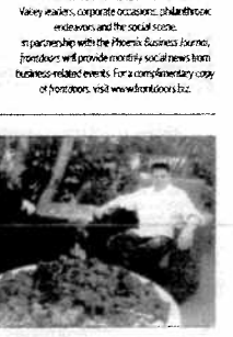
Frank Lloyd Wright. The resort's former Arizona Wing, originally opened in 1909, was completely renovated to create Ocotilla.